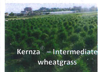
Kernza ® – Intermediate wheatgrass